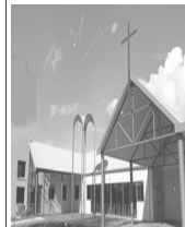
St. John the Baptist